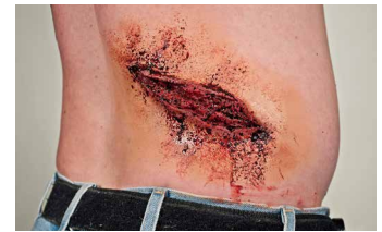
Superficial Large Laceration