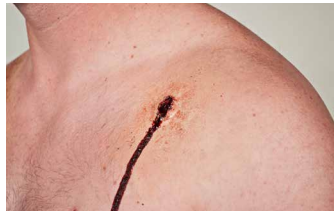
Gunshot Entrance Wound