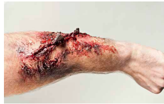
Forearm Laceration with Shrapnel