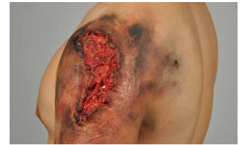
Upper Extremity 3rd Degree Burn