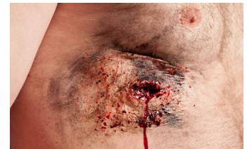
Sucking Chest Wound