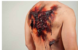
Penetrating Shrapnel Wounds