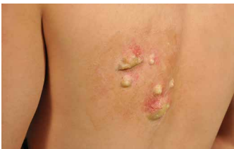
2nd Degree Partial Thickness Burn