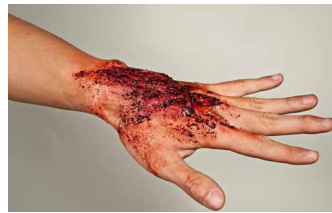
Dorsal Hand 1st & 2nd Degree Burns