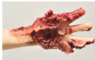
Partial Hand Amputation