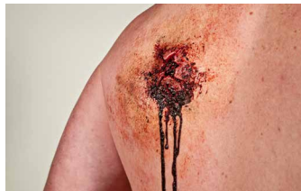
Gunshot Exit Wound