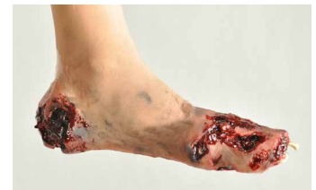
Partial Foot Amputation