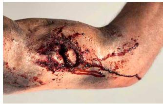
Compound Humerous Fracture