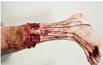
Compound Fibula Fracture