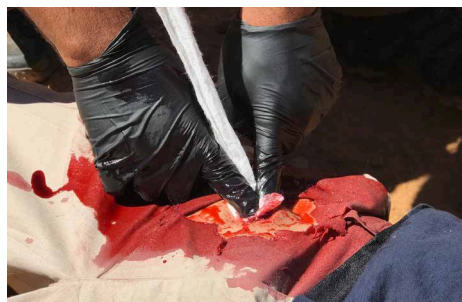
Packing the wound using gauze