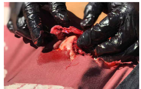
Pack completed utilizing one roll of gauze