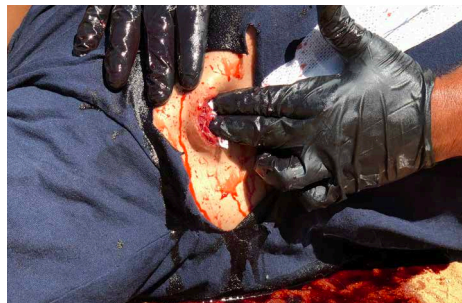
Packing the wound using gauze