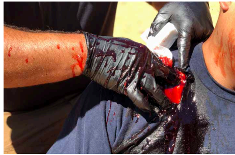
Packing the wound using gauze