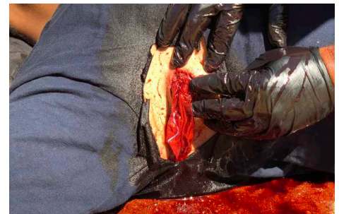
Pack completed utilizing one roll of gauze